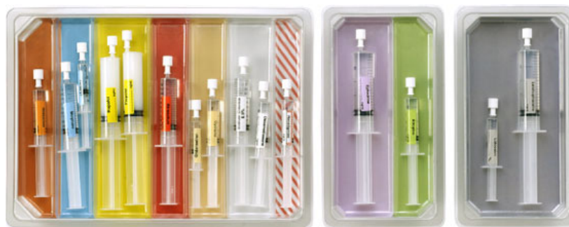
Figure 1 The Rainbow tray.